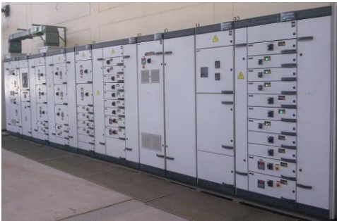
Fig. 5.b Autoclave power panel