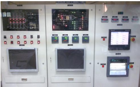
Fig. 5.a Autoclave control panel