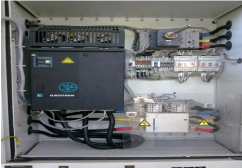
Fig. 4 Thyristor Bank For Heater power Control